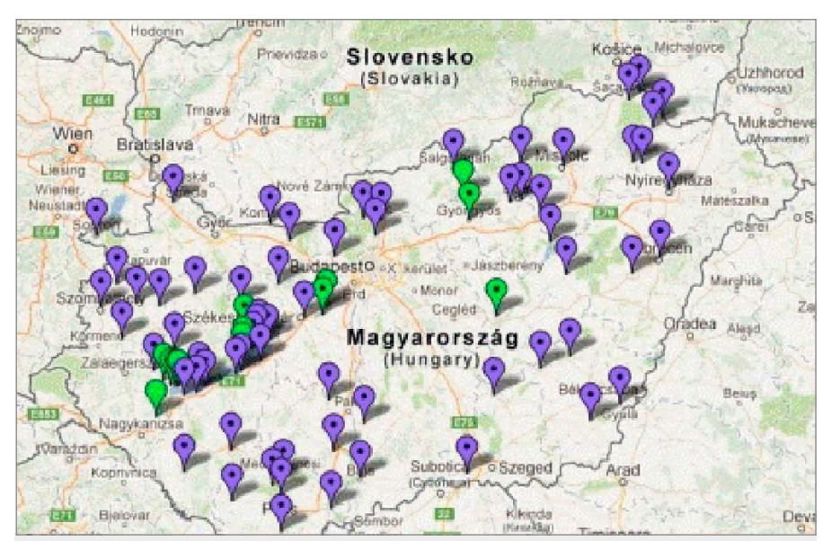
Figure 2 Hungarian TDM Organizations in 2013 Blue: only local TDM Organization. Green: Local and micro-regional TDM Organization is in the areas

organization was born around Balaton in 2011. The Hungarian TDM Alliance inquired in which year they came into existence mostly among the registered TDM organizations. The total of 40 %of the registered TDM organizations took part in the inquiry, thus, complete conclusions may not be drawn. The result shows well the beat of the domestic organization development. Visibly, more organizations came into existence in the tender period. The number of TDM organizations was insignificant before 2005, whereas in 2008-2009 and in 2010-2011, the number of organizations increased continuously. The sustainability of operation of the organizations has been ensured only in short-term. They hope the nascent tourism law will determine the income of tourism tax to return to the TDM organizations and there will be better drawdown opportunities for the tender supports (Hungarian TDM Alliance, 2013).